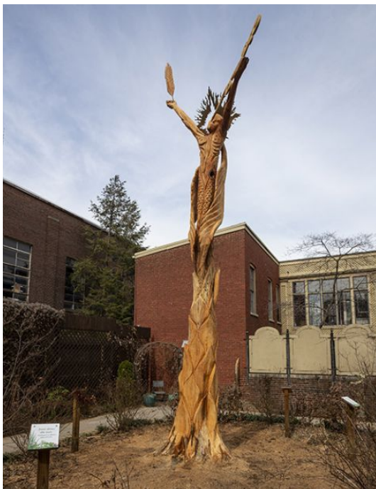
An old maple tree under which sisters used to gather has been carved into an angel reaching almost 30 feet into the sky.

Before resident care could begin, volunteers had to tear out the old heavy steam radiators and weatherize the windows with rope weights (both things some of the young volunteers had never seen.) They also pulled up 4,000 square feet of carpet to expose the beautiful hardwood floors. Then a skilled contractor came in and turned the two parlors into a meditation room for those seeking comfort and quiet, and a bright and comfortable bedroom for a resident.