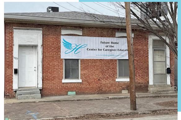
1429 is part of The Center for Caregiving Education