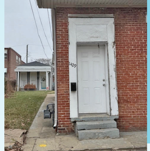
Hildegard on Story (1427) to the left. 1429 is part of The Center for Caregiving Education.

While the renovation costs are secured, we will still need funding for technology, furniture, appliances, and fixtures. If you are called to help with this new endeavor, we welcome your support. And prayers!